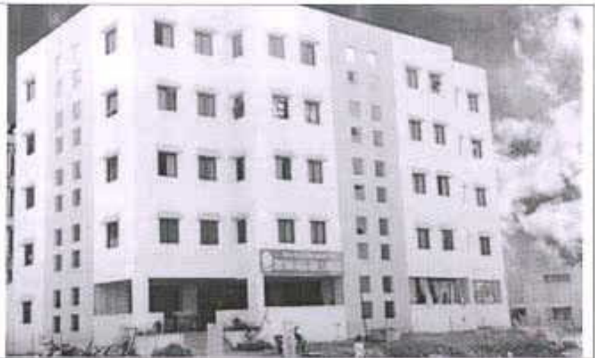
Computer Center facilities