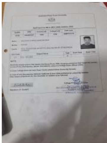
WhatsApp Image 2023-04-28 at 2.28.02 PM1.jpeg ~127 KB