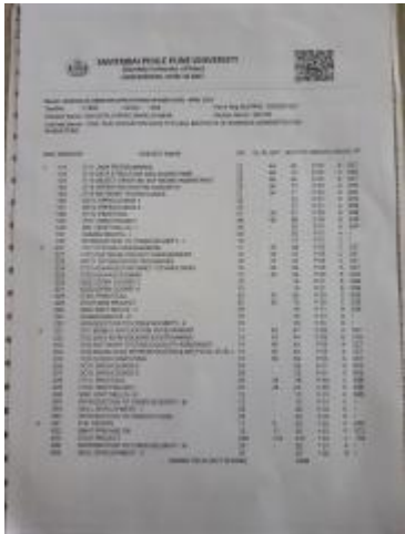
WhatsApp Image 2023-04-28 at 2.28.16 PM3.jpeg ~172 KB