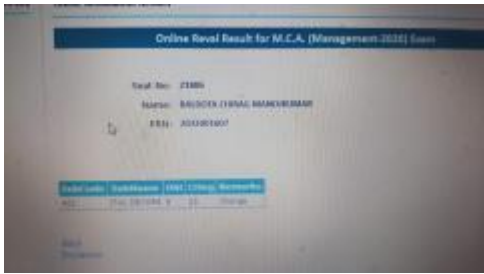
WhatsApp Image 2023-04-28 at 2.28.02 PM2.jpeg ~173 KB