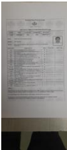
WhatsApp Image 2023-07-07 at 12.32.07 PM.jpeg ~83 KB

Addr: Behind Bhairavnath temple Survey No 39 Narhe Tal: Haweli(excluding Corporation Area) Dist: Pune 411041