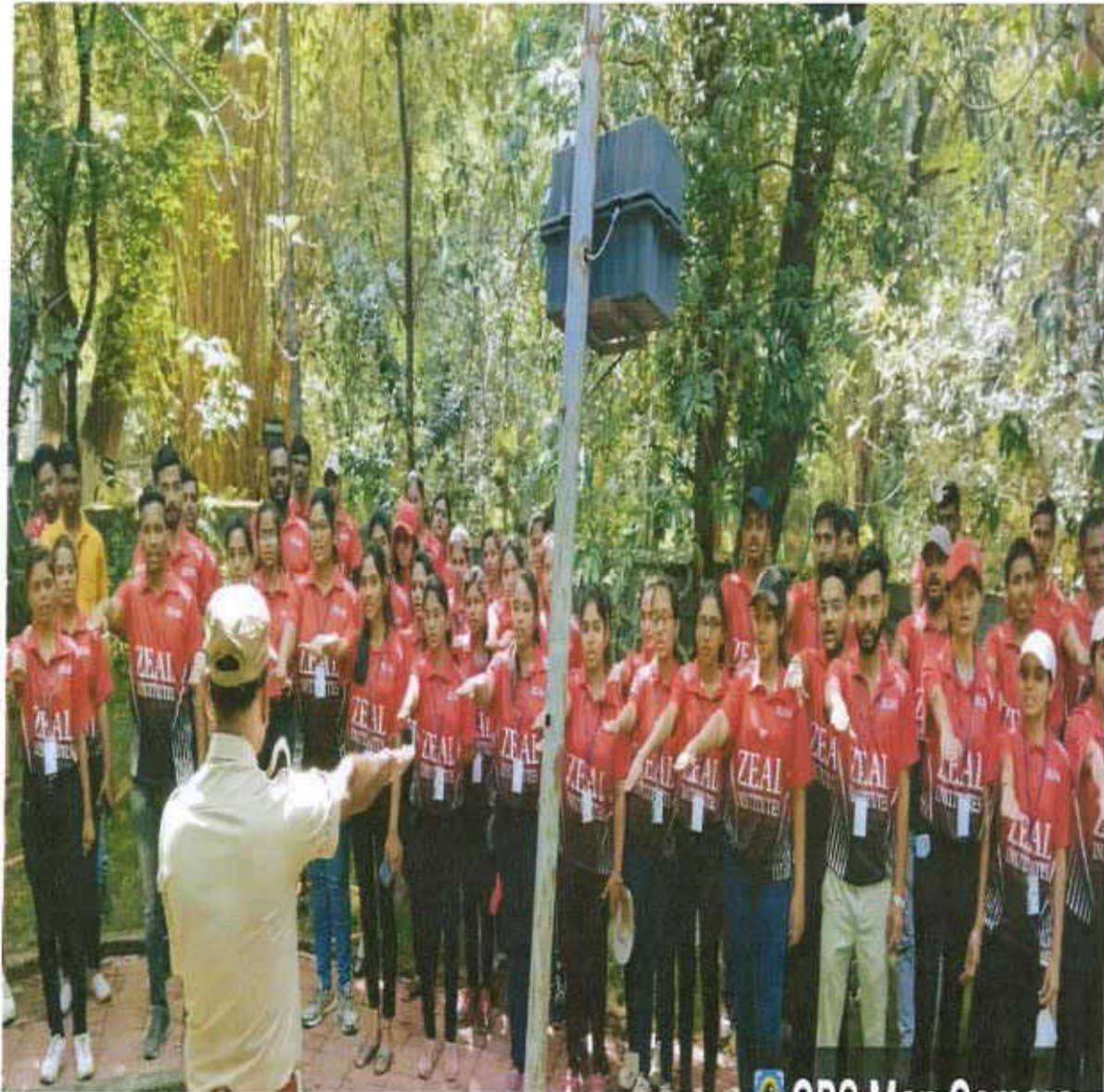
Pictures of plantation, pledge taken on the eve of World Environment Day