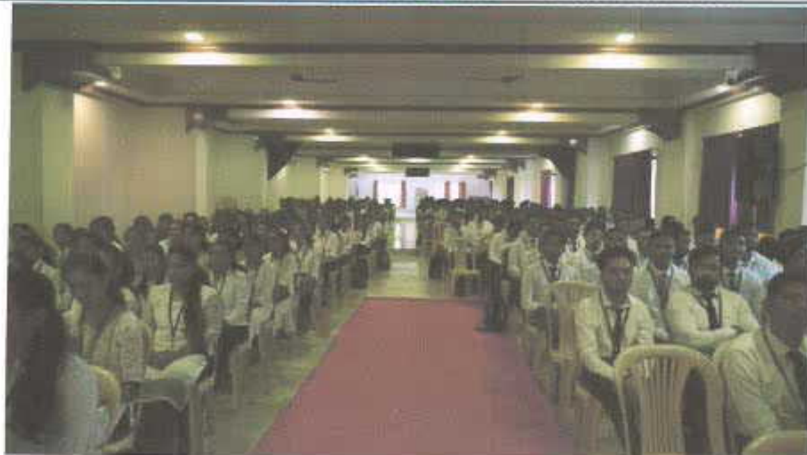
Photograph showing group of attentive students