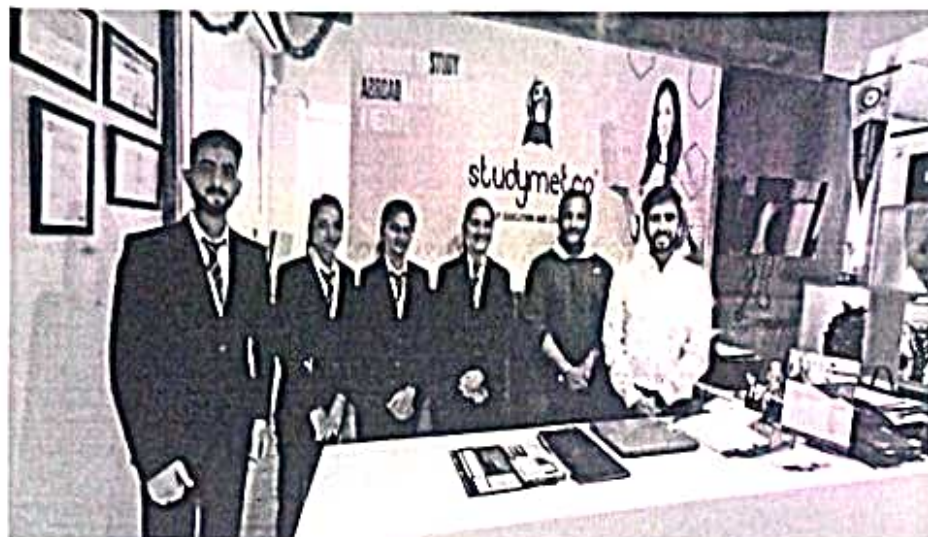
Our student Visited to Set Met co.