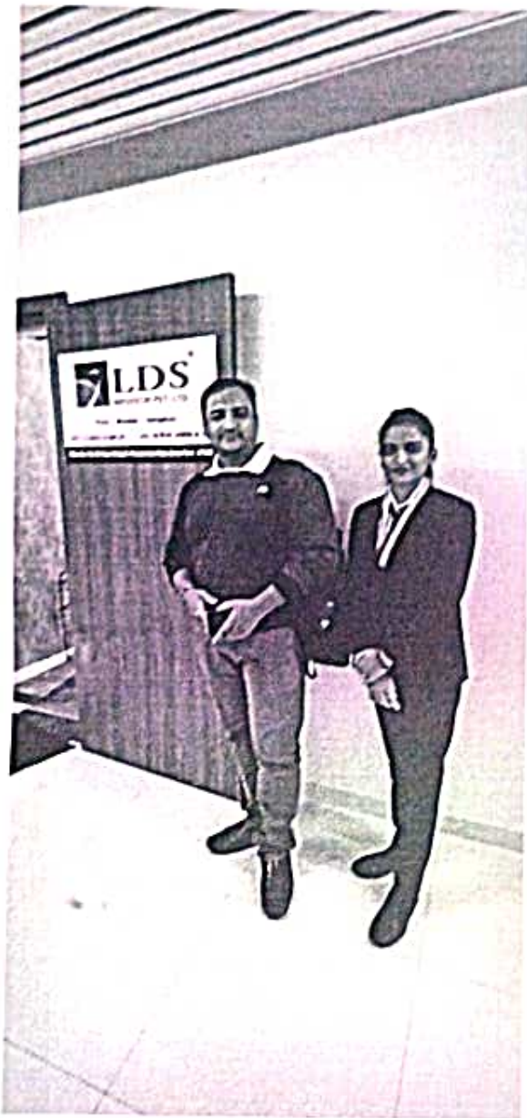
- Our student to Industrial LDS InfoTech co.