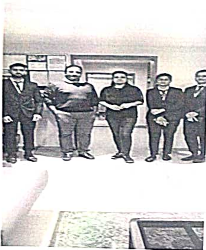
Our student to Industrial LDS InfoTech co.