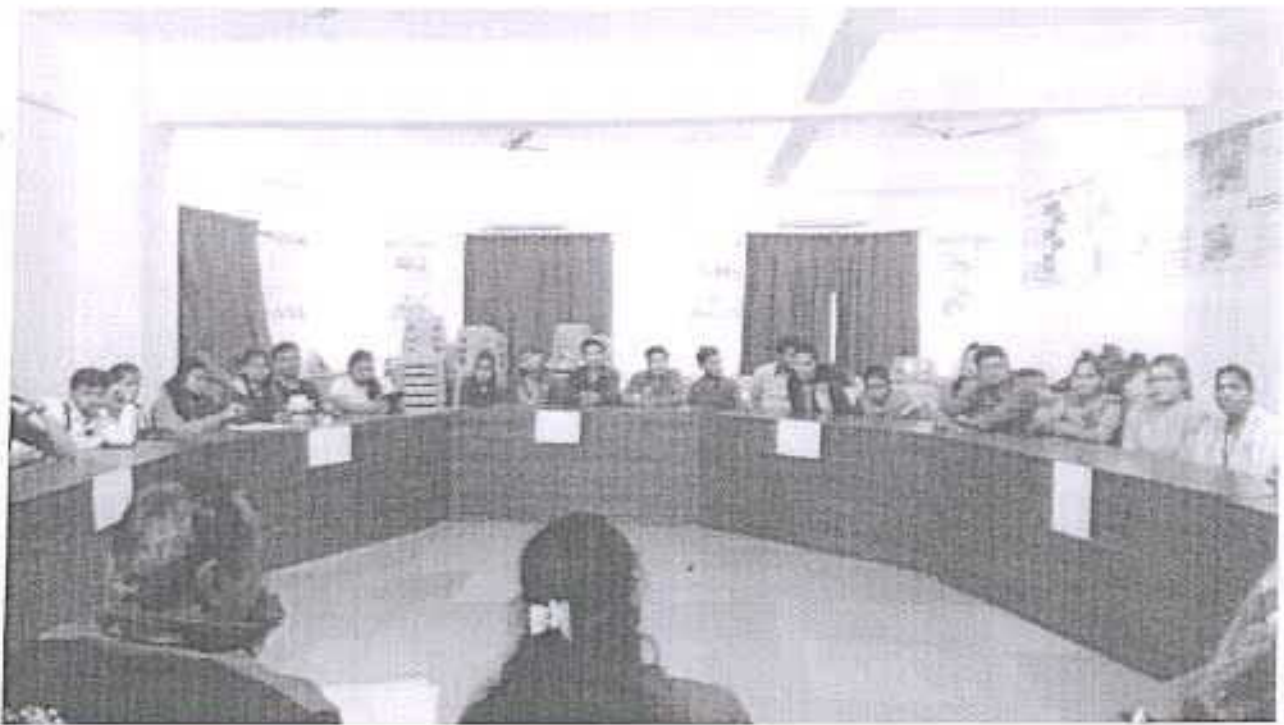
Snapshot 1: Students of MBA and MCA