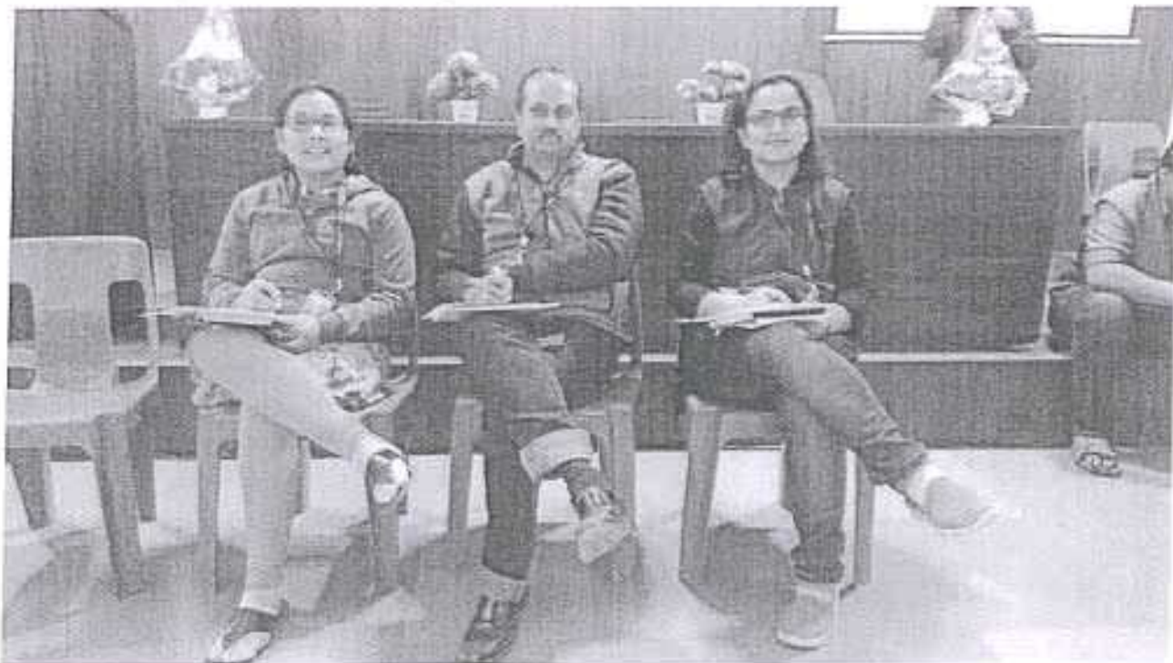
Snapshot 2: Faculty members as judges of competition