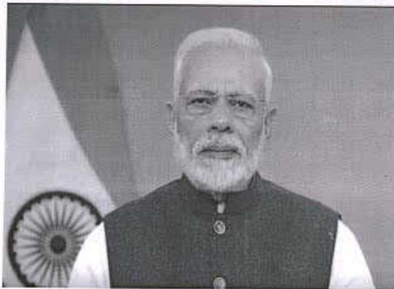
Snapshot 1: Mr. Narendra Modi, Prime Minister of India

PM Modi, since three years, has been interacting with the students from the country, regarding the hurdles in the studies and smooth performance in the exams, as well as the ways and approaches to react the failures in the same.