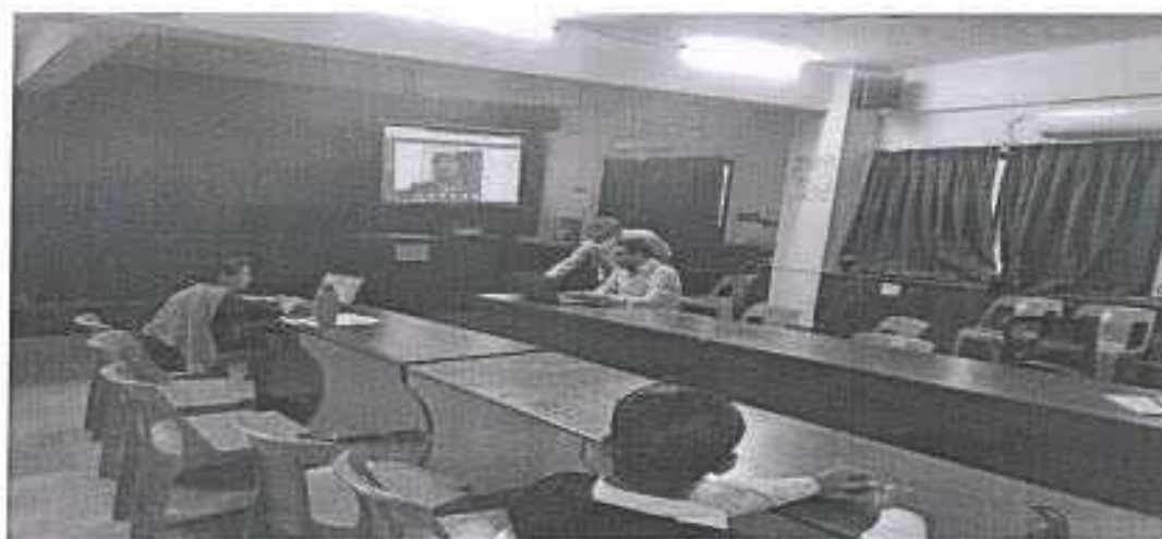
Photo 2: Panel Discussion on Budget session Live with Students Question & Answers Session Going on.