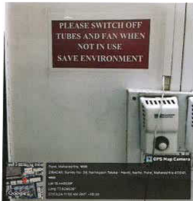
Typical display board near each switchboard

Students are made aware to conserve electricity through various displays.