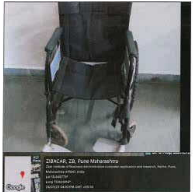
Wheel Chair for Divyangjan