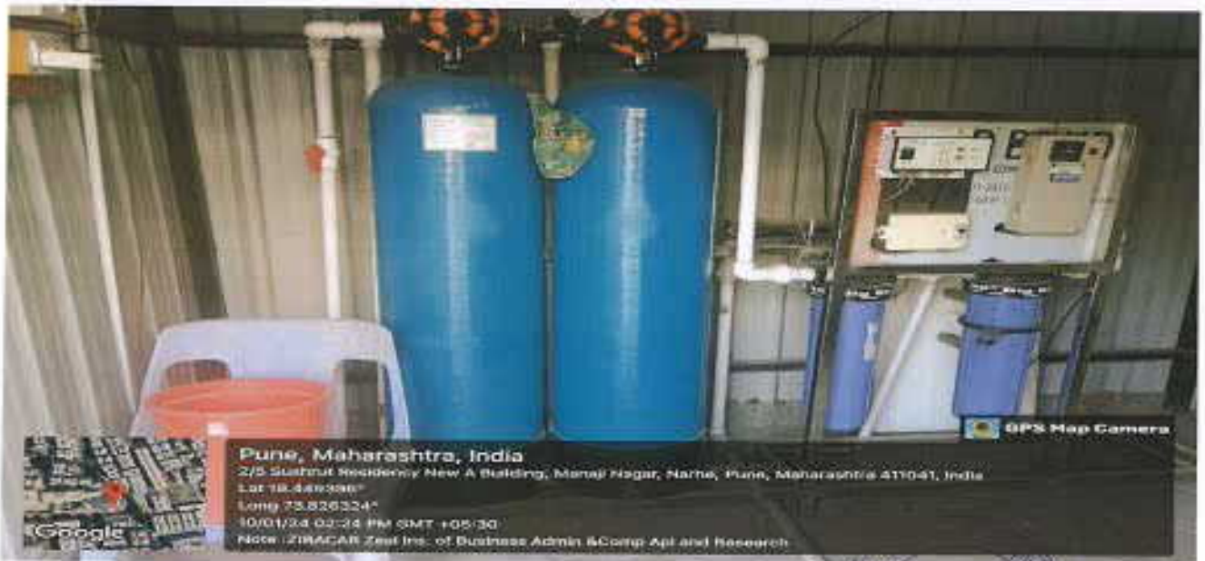
Water purification plant in our campus