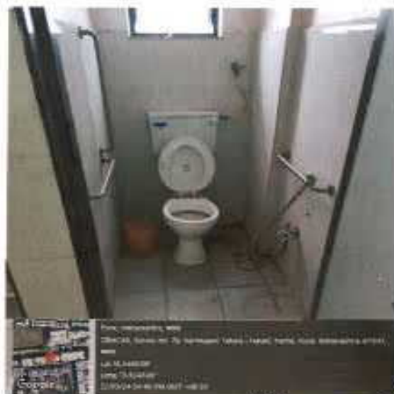
Photograph showing Divyangjan Washroom.