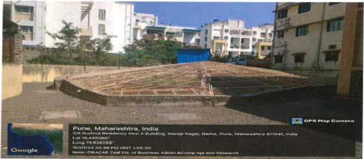
Photograph showing open well recharge through rainwater harvesting

In campus rain water is harvested and recharging of this open well is followed effectively.