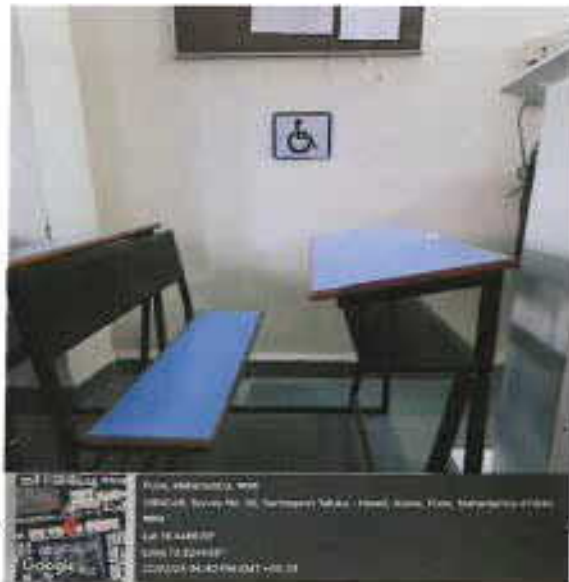
Divyangjan Sitting Arrangement in Classroom