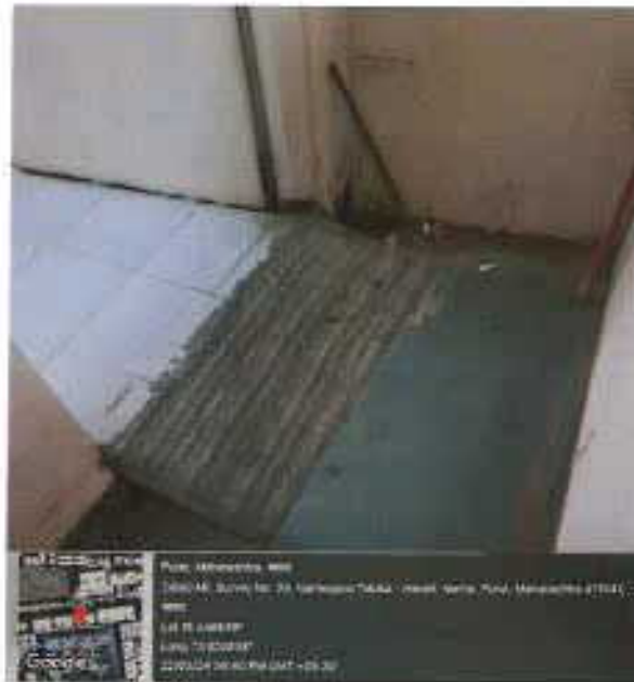
Photograph showing lift and ramp facility

A special arrangement is made for Divyangjan to access washrooms and ramp.