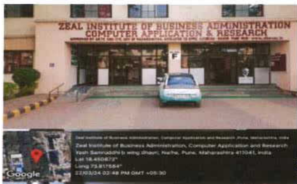
Photograph showing Divyangjan Ramp and Parking area.