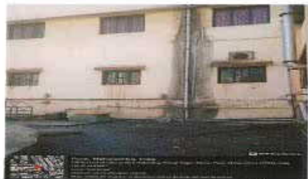
Rainwater is collected in the reservoir through Pipes