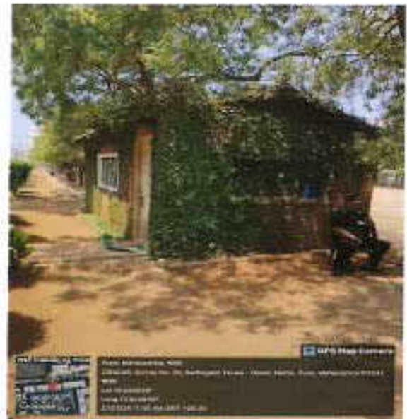
Green House in Campus