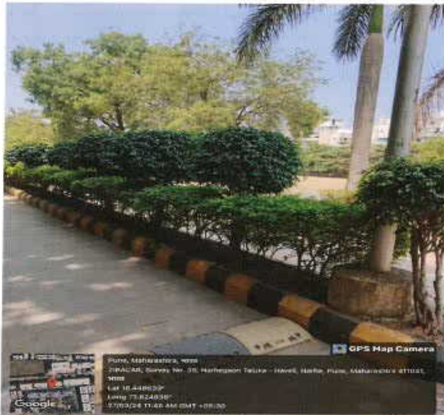
Greenery in the Campus