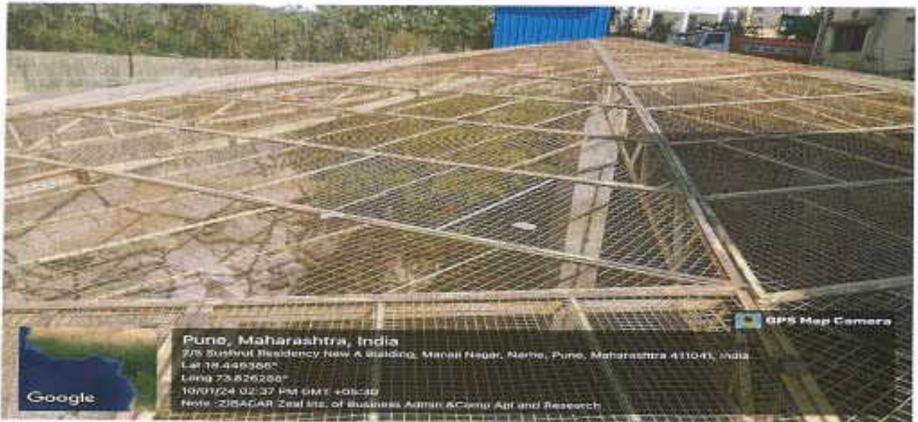
Open welling campus

Institute has open well in premises as water source which is able to fulfill water demand of campus for drinking, sanitation and gardening