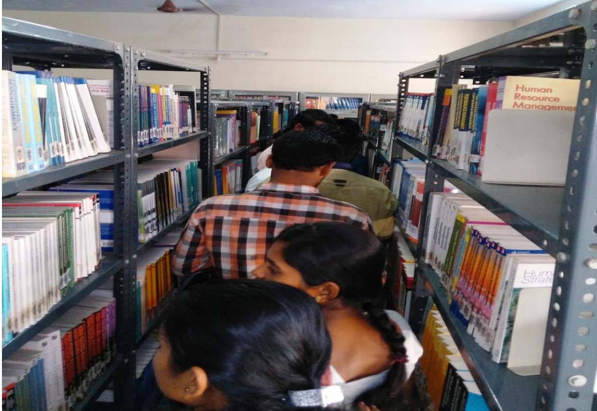
Snapshot 4: Students getting information of various books and reading material