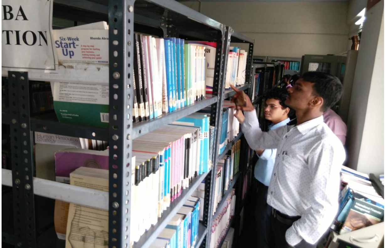
Snapshot 3: Students getting information of various books and reading material