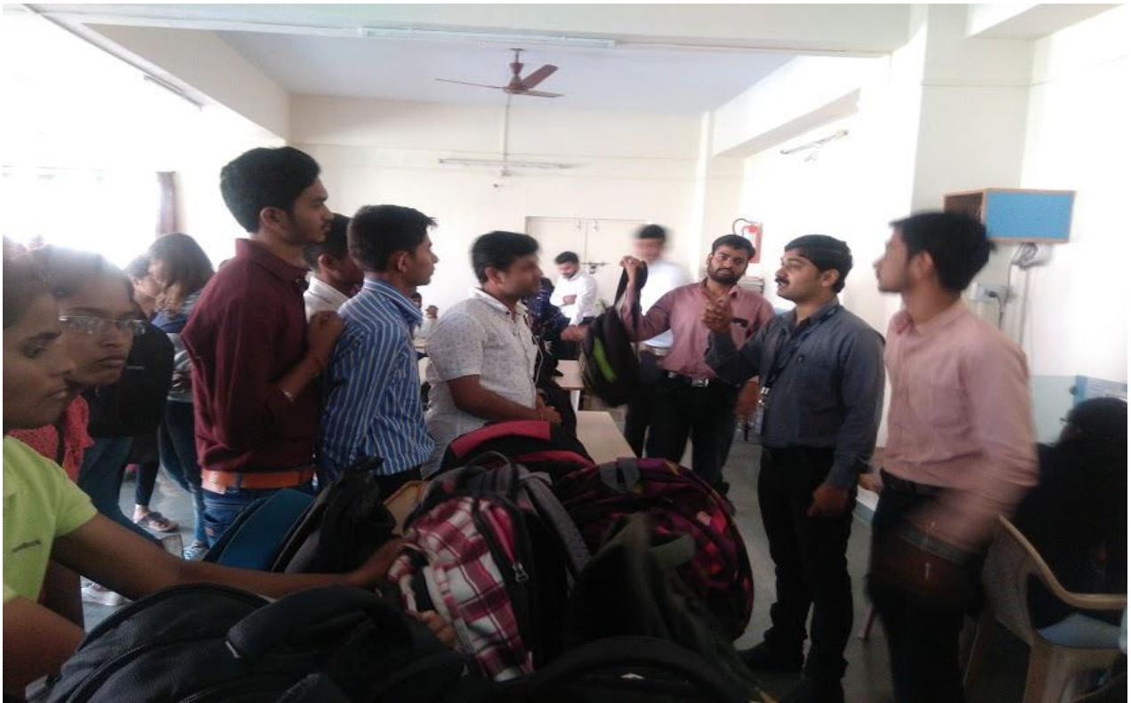
Snapshot 4 &5: Students getting information of Reading Hall facility