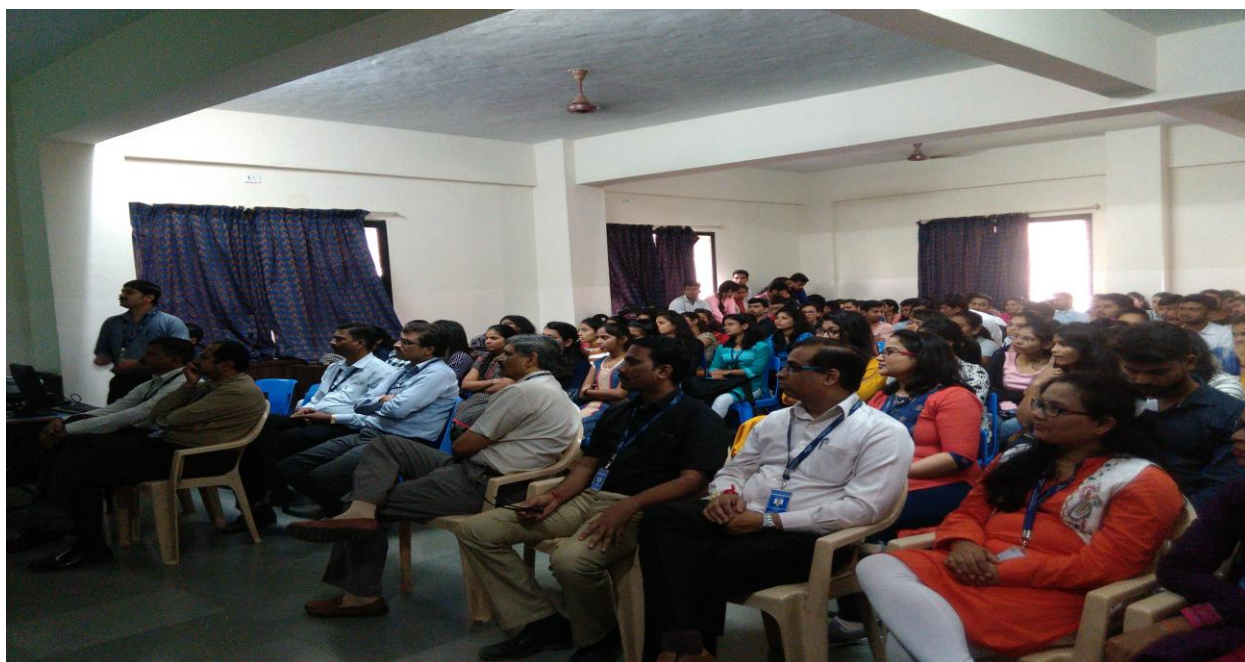
Snapshot 1: Faculty and Students at Orientation program

The Students Orientation programme was captured well with the help of photographs.