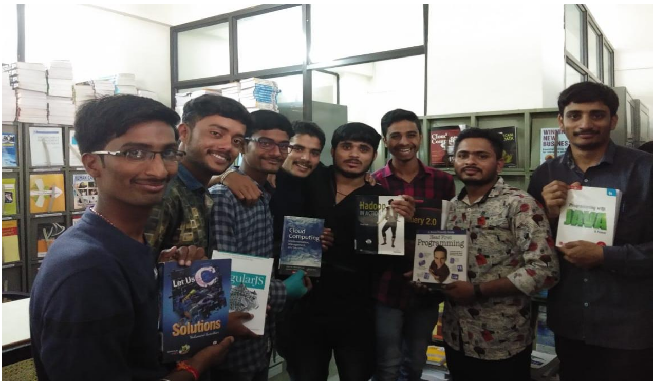
Snapshot 13: Students viewing the various books in the library