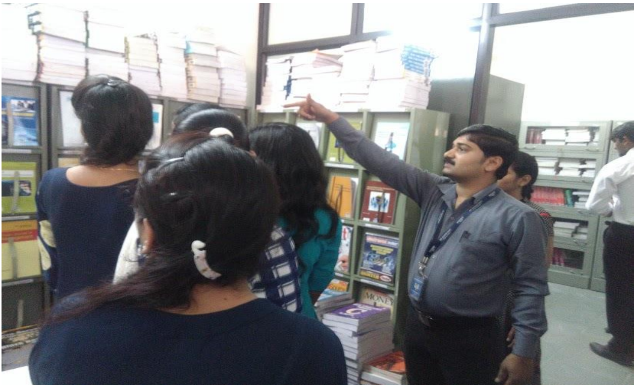
Snapshot 3: Students getting information of various journals and reading material