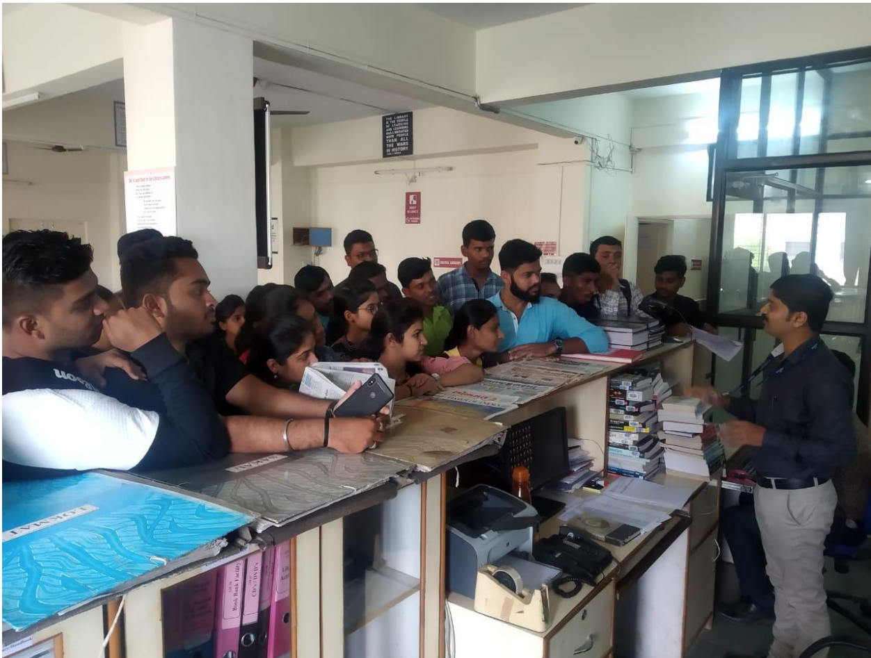
Snapshot 3: Students getting information of circulation system