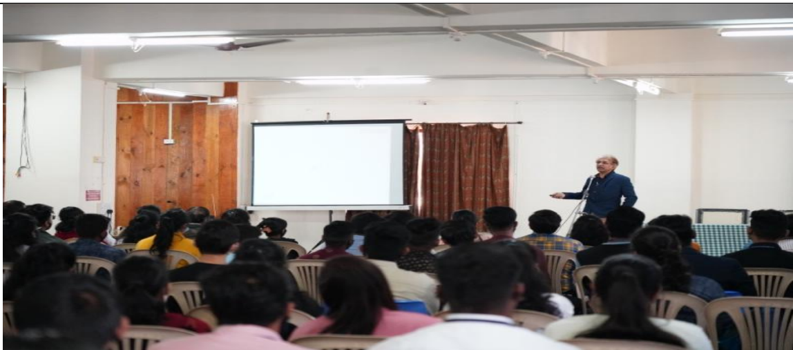
Photo 5. Session attended by the students