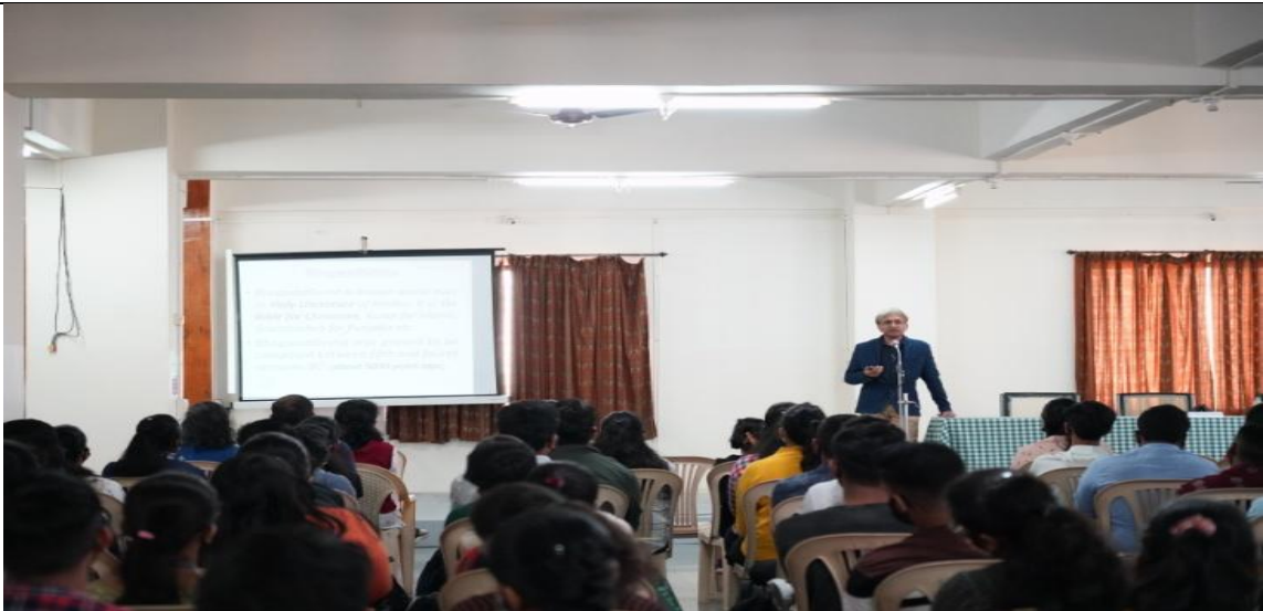
Photo 4. Session attended by the students