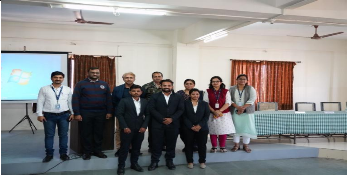
Photo 3. Organising Team