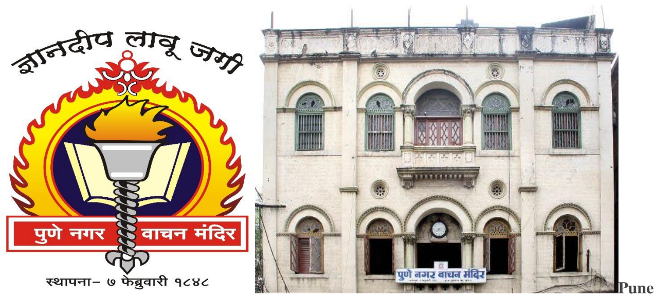
Nagar Vachan Mandir