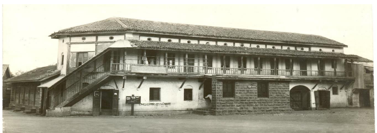
Old Library- Poona Native General Library