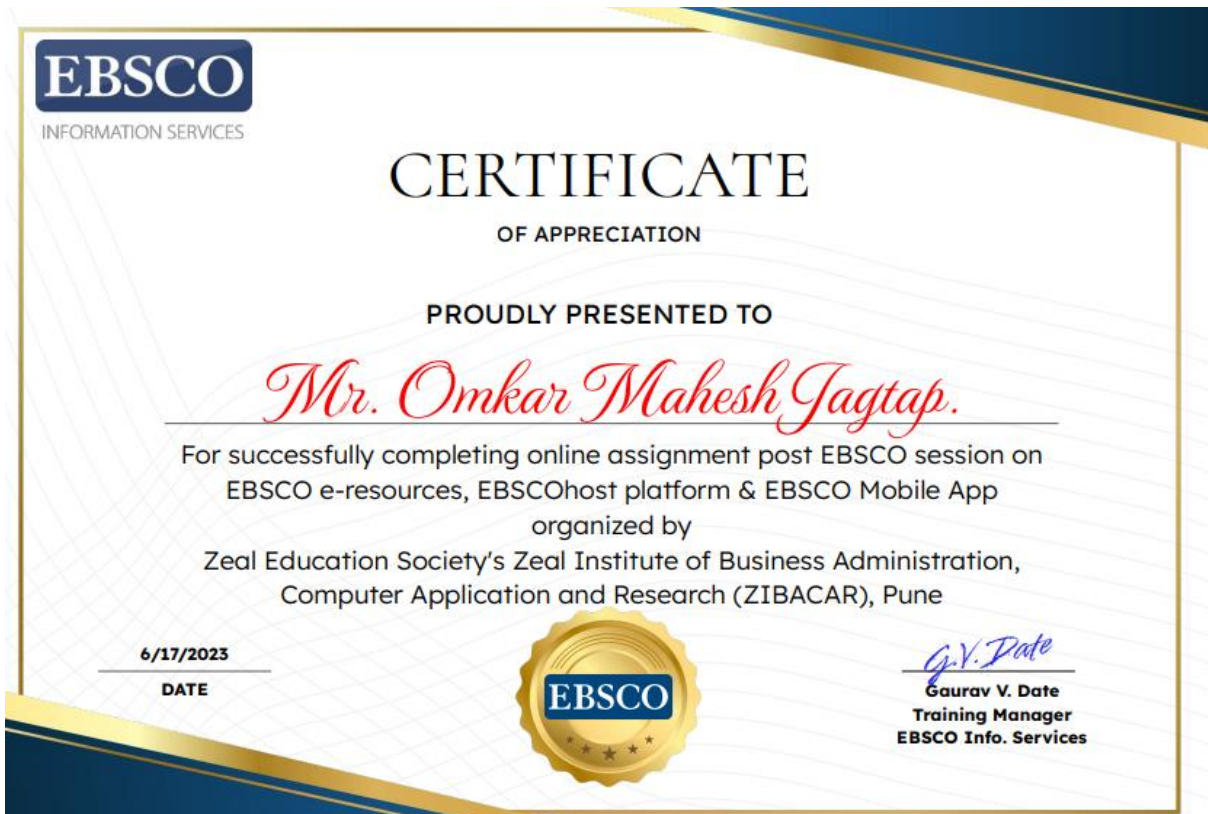
Photograph 4 .- Sample Certificate of Participants