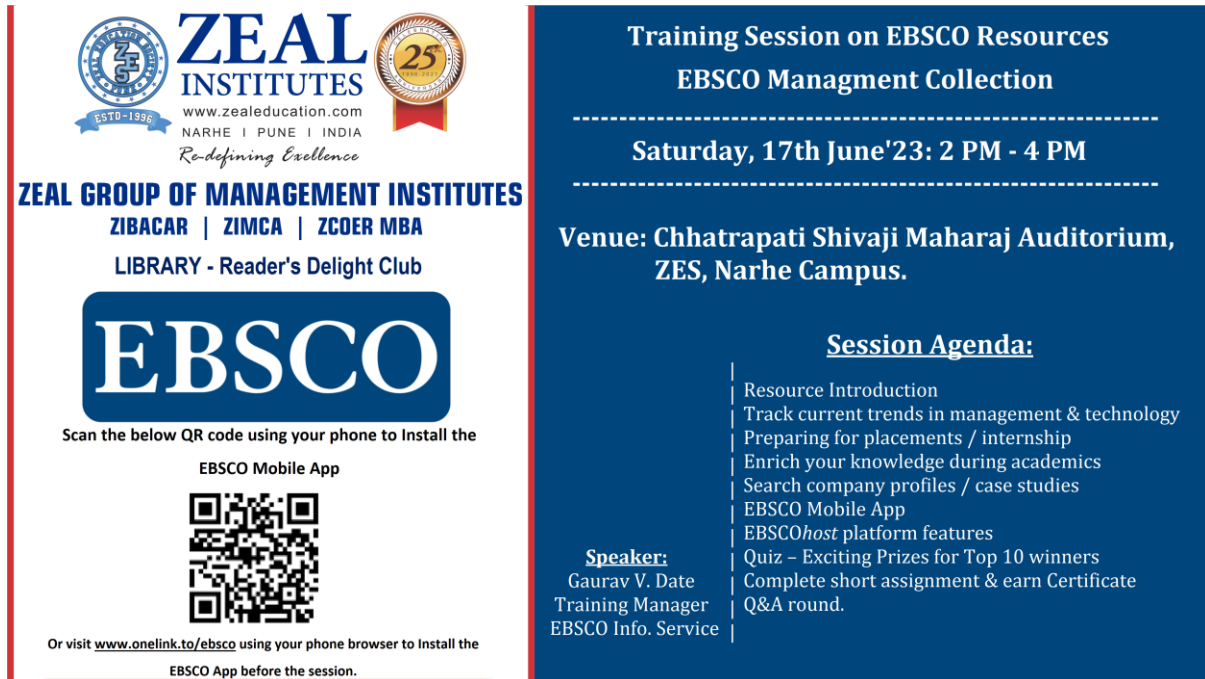
Photograph 1.- Poster of the Ebsco Webinar