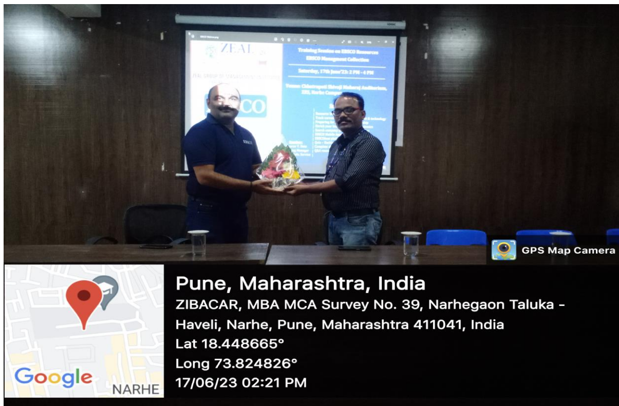
Photograph 2.- Welcome of Trainer by Director