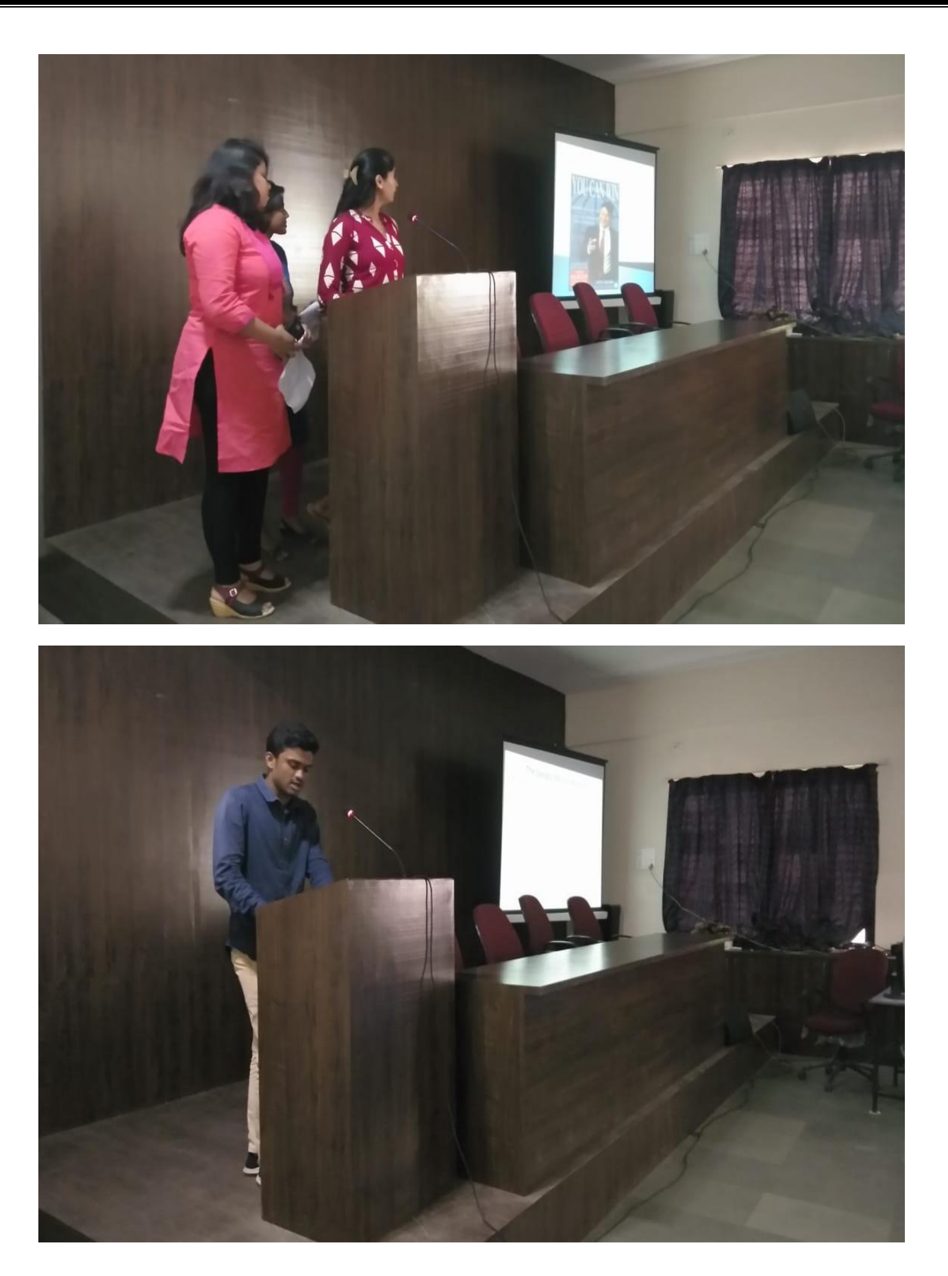
Snapshot 9 & 10: Participants Presentation for the Book review competition