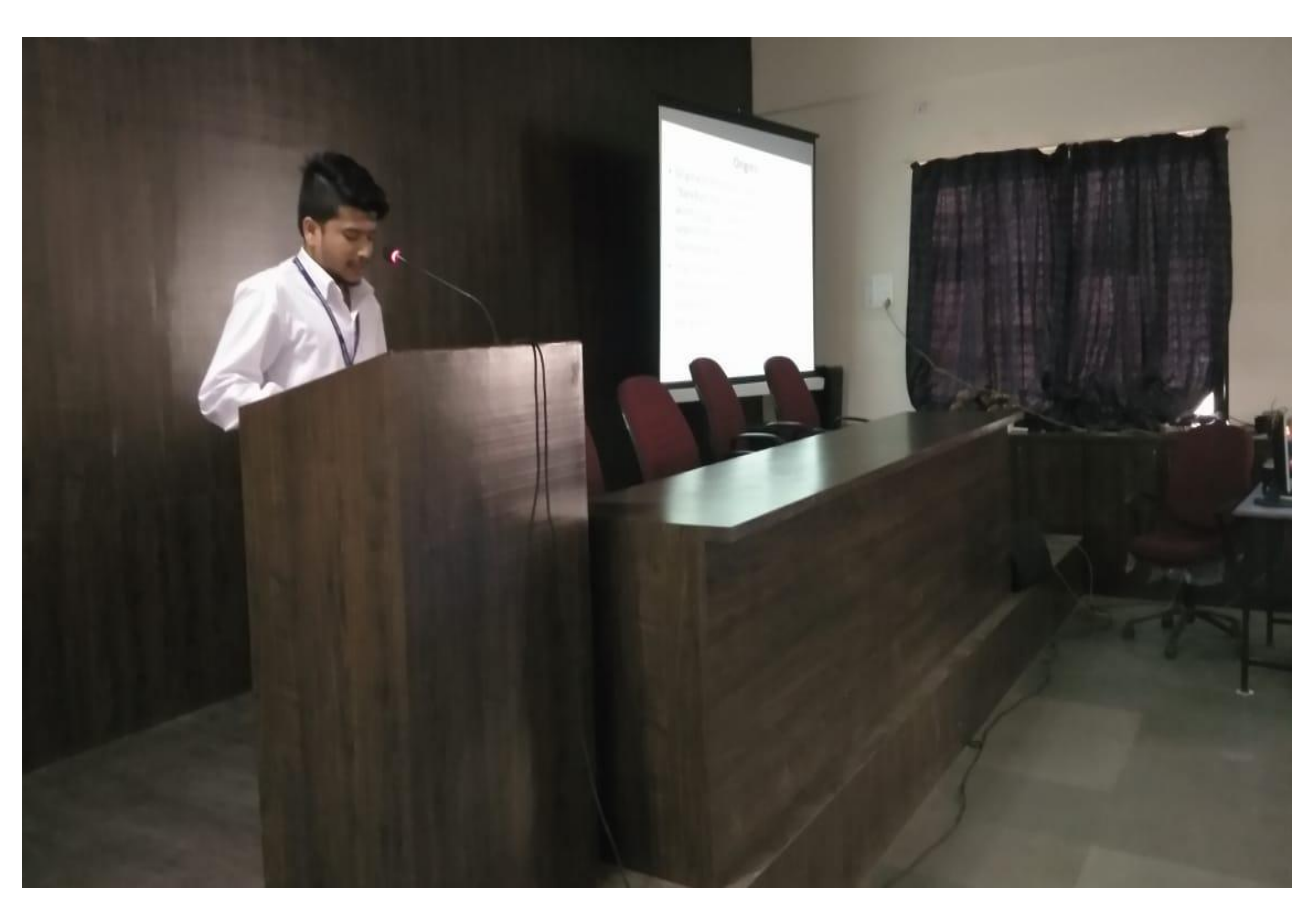
Snapshot 11: Participants Presentation for the Book review competition