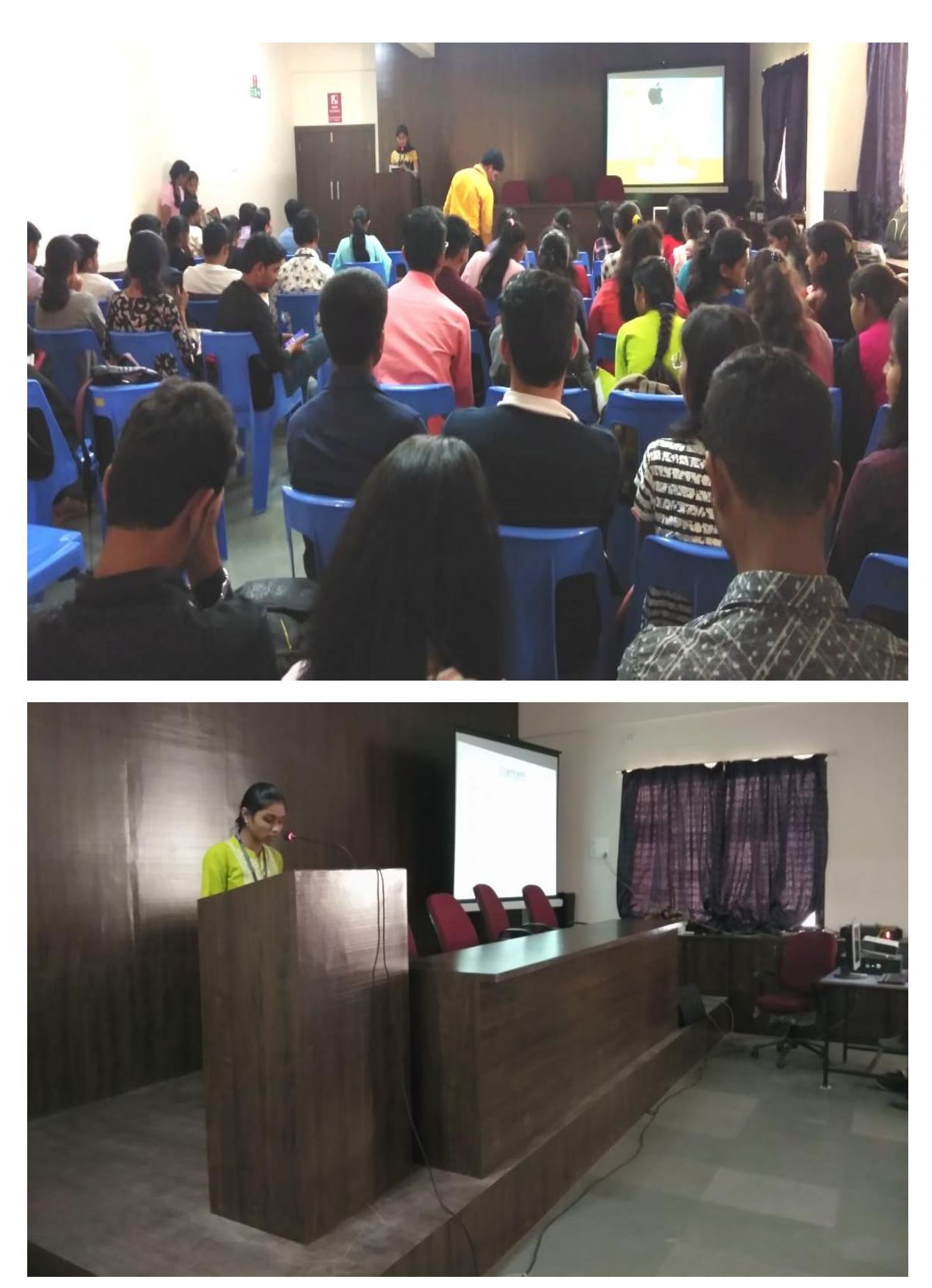
Snapshot 5 & 6: Participants Presentation for the Book review competition