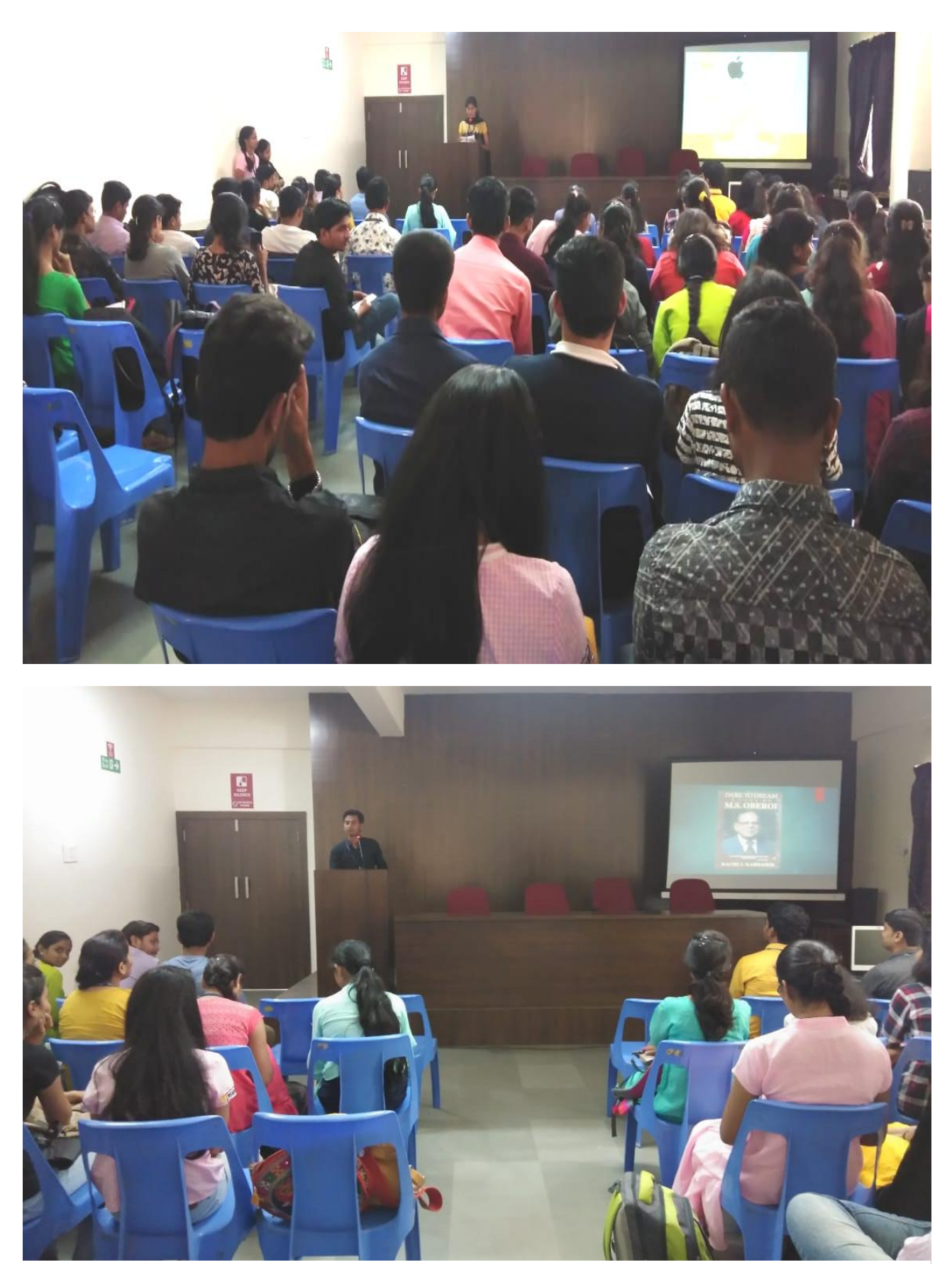
Snapshot 3 & 4: Presentations & Audience for Book review competition