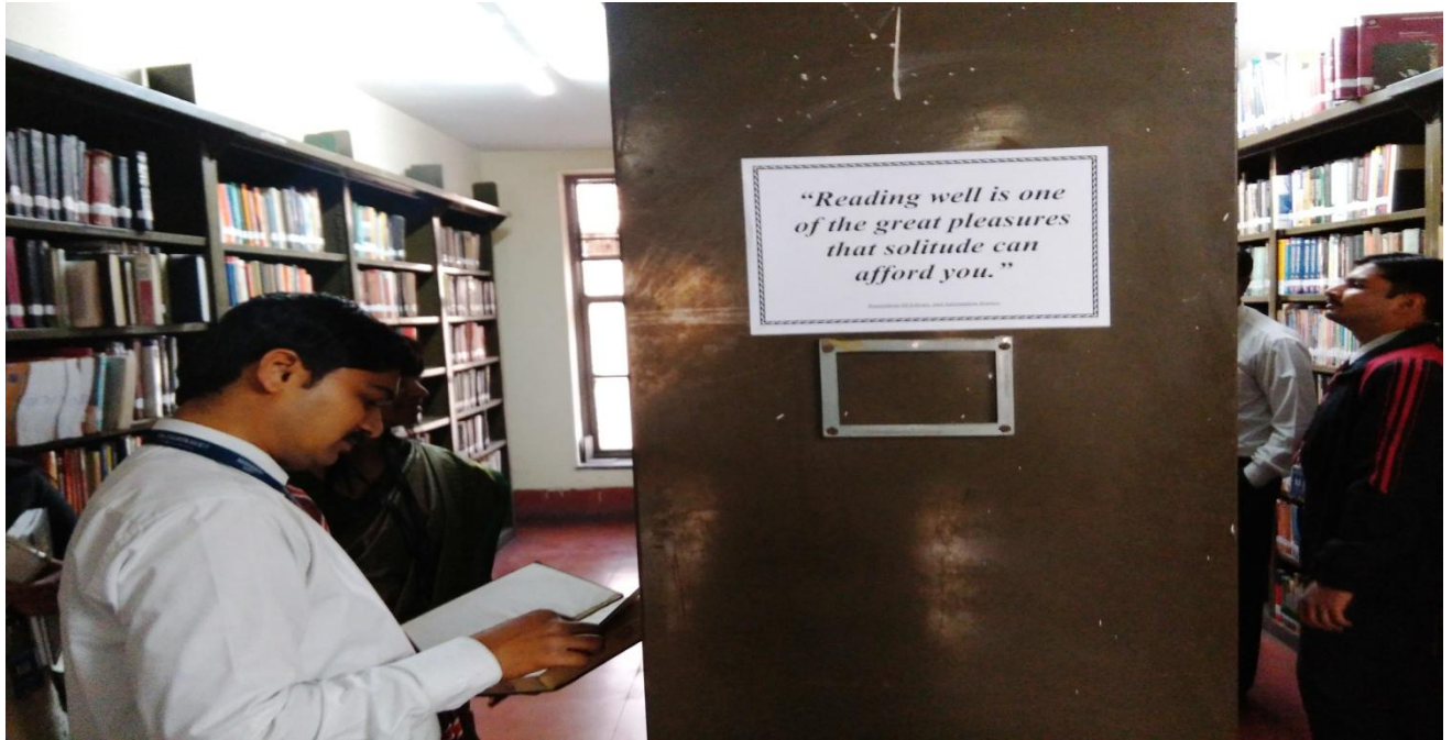
Snapshot 8: At Jayakar Library