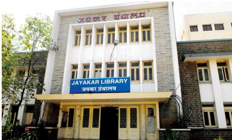
Snapshot 1: Jayakar Library