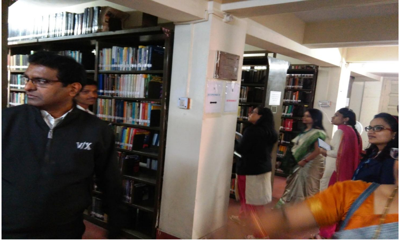
Snapshot 9: At Jayakar Library