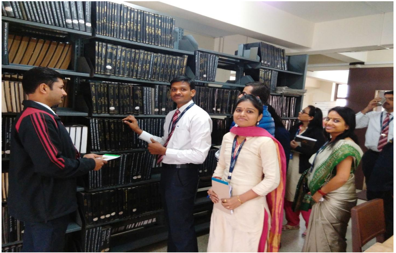
Snapshot II: At Jayakar Library