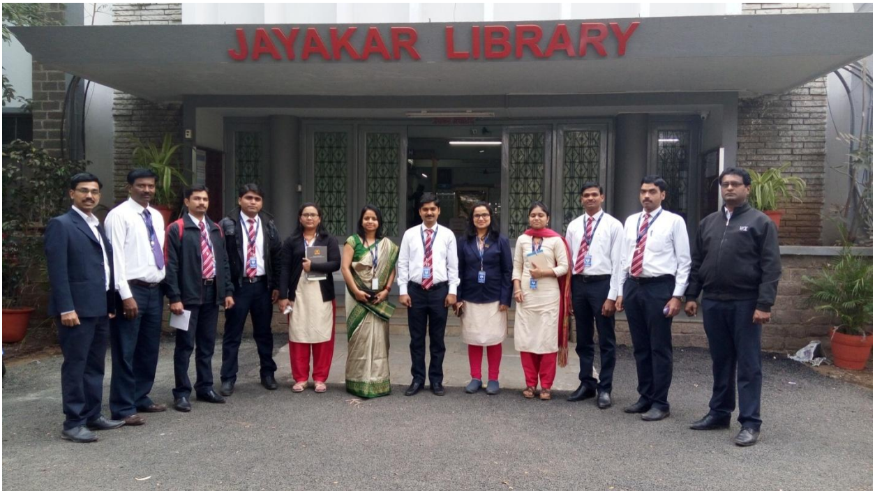
Snapshot 3:Jayakar library