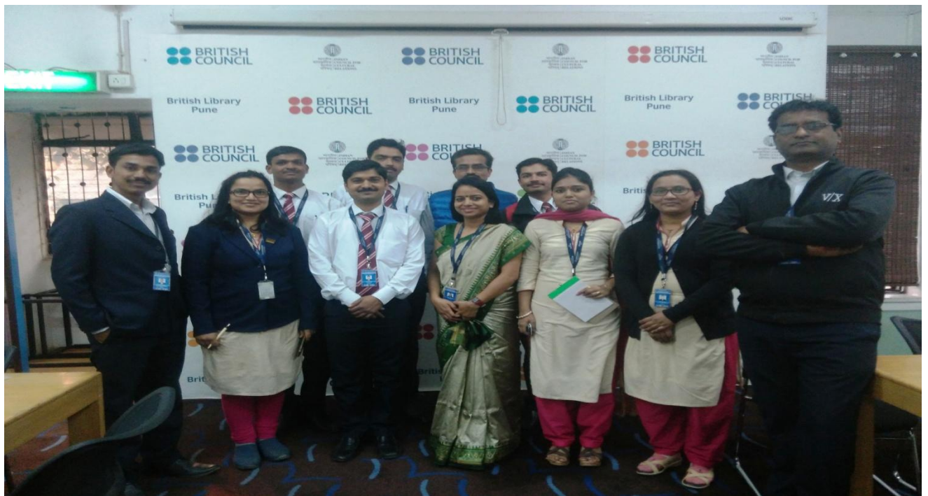
Snapshot 5: British Library