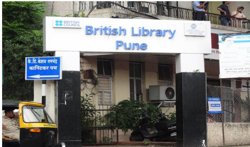
Snapshot 2 : British Library, Pune