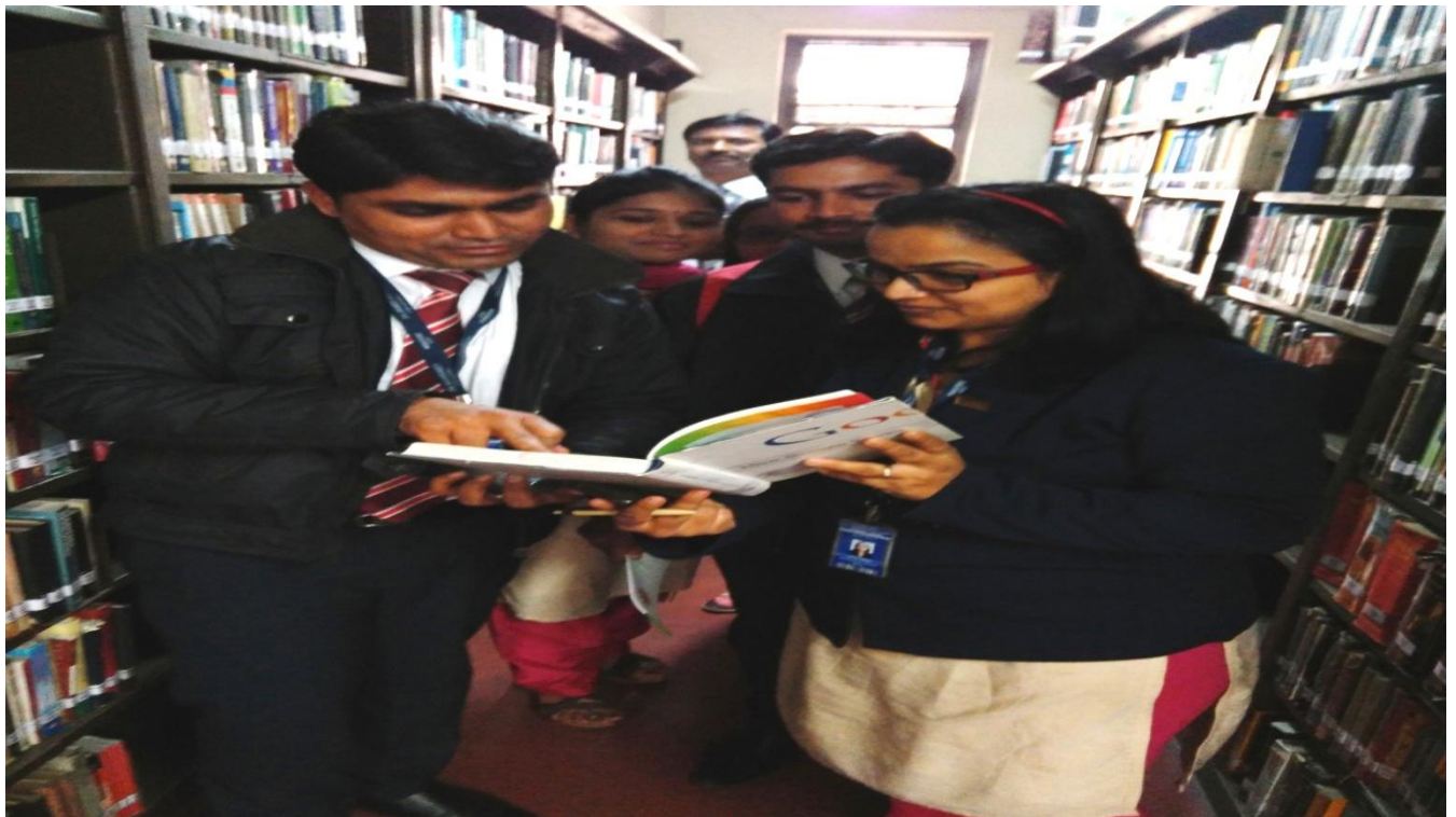
Snapshot 7: At Jayakar Library