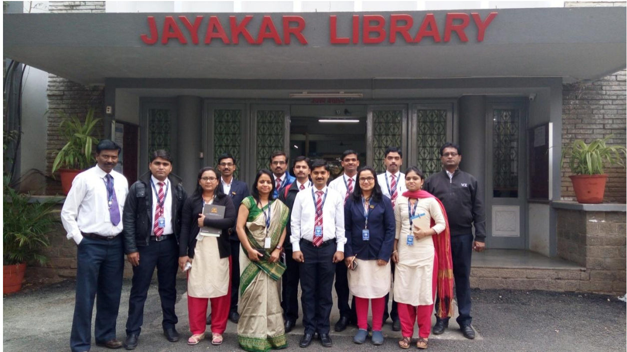
Snapshot 4: Jayakar library