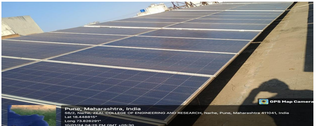
Solar panels at rooftop