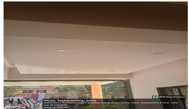
Photos - Use of LED's