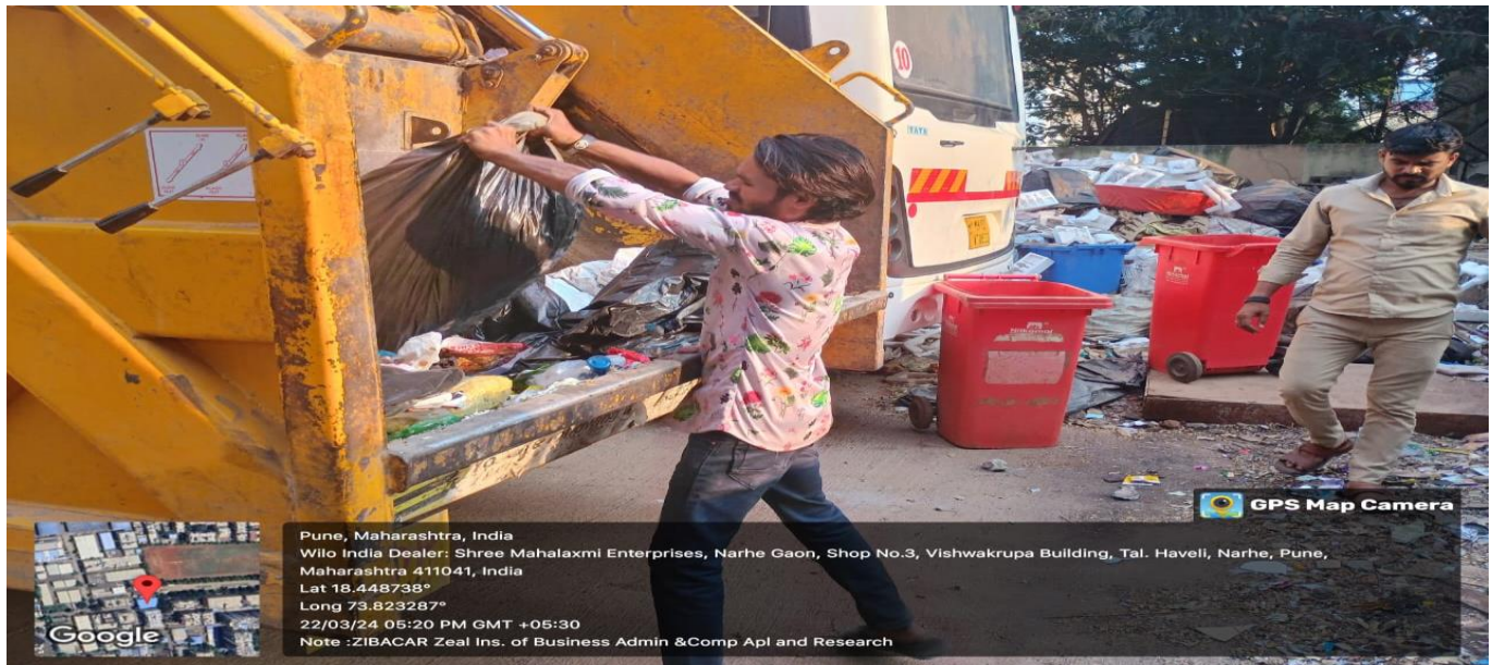
Garbage Collection and transportation by PMC Van