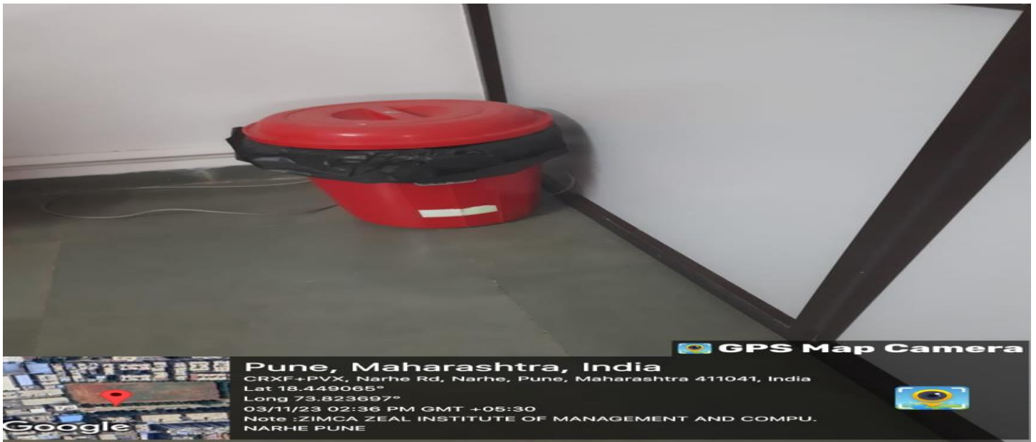
Dustbins at various locations