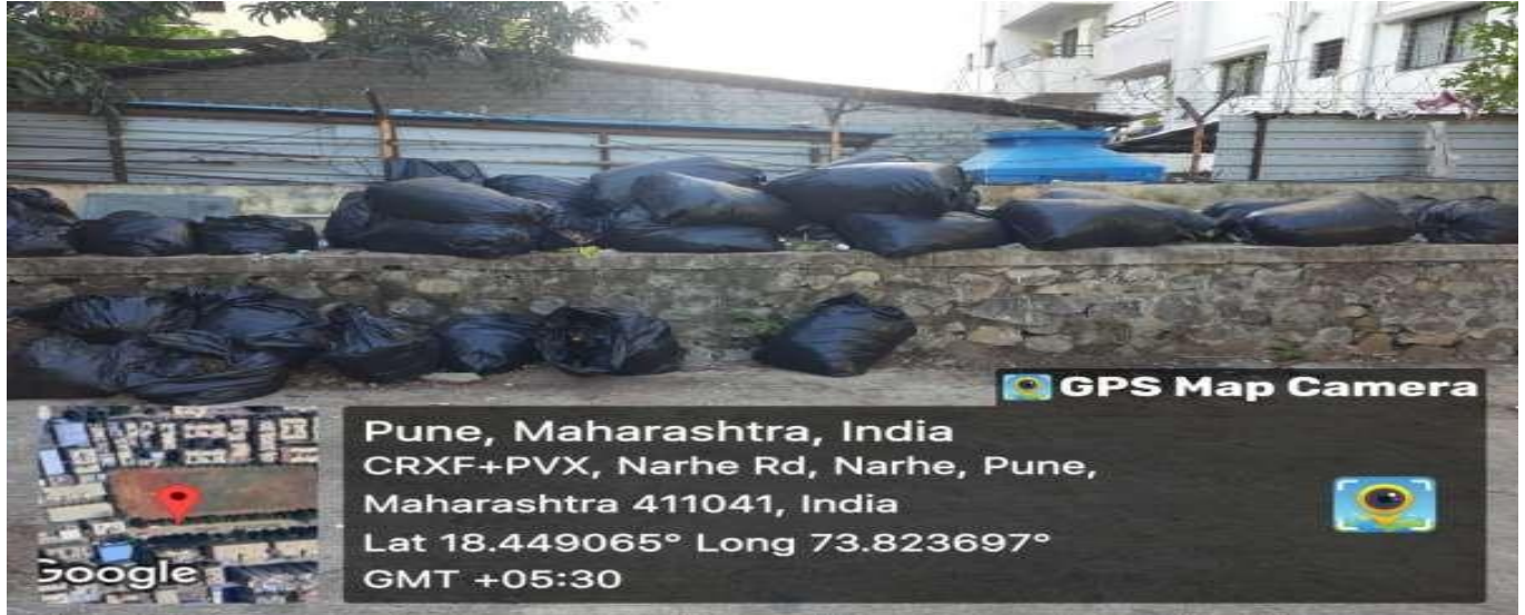
Garbage Collected at one place