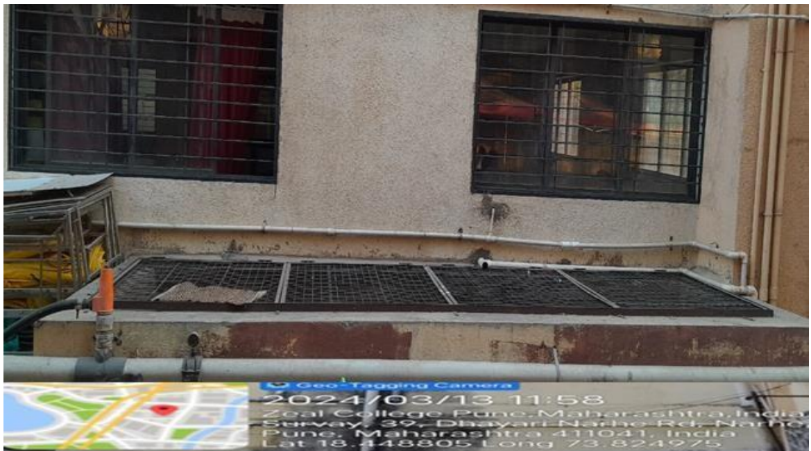
Image-7.1.4 (4b) - Maintenance of water bodies and distribution system @ ZES Campus