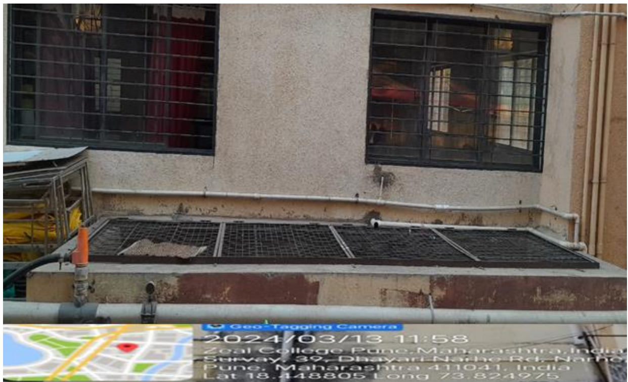
Image-7.1.4 (4b) - Maintenance of water bodies and distribution system @ ZES Campus