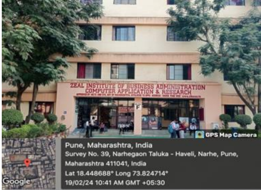
: Green Landscaping with trees and plants at ZES Campus