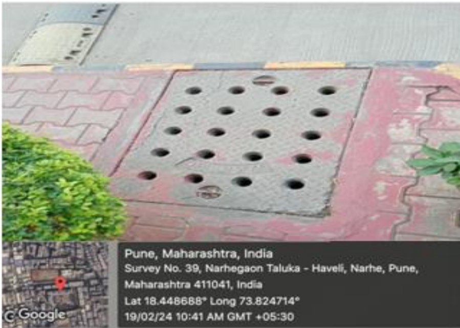
: Underground Drainage System at ZES Campus