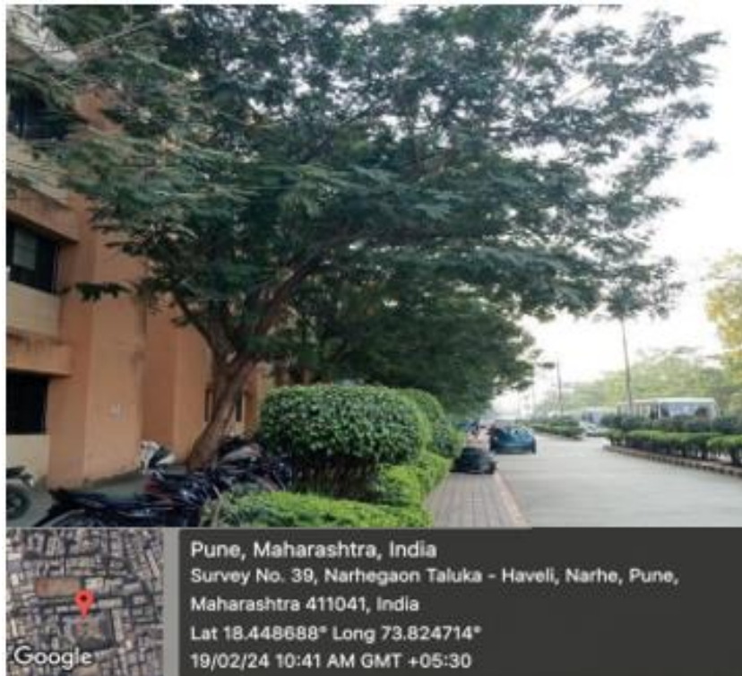
: Green Landscaping with trees and plants at ZES Campus

The entire ZES campus has landscaped with green lawn and shady trees making the campus green and pollution-free which enriches a good educational environment. Also institute creates awareness about pollution-free environment and the green campus by engaging activities like Swachh Bharat Abhiyan, Eco-friendly Ganesh Visarjan etc.