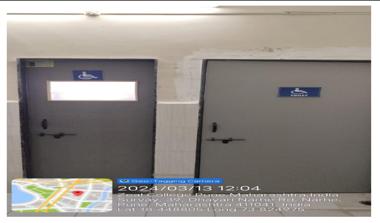
Image-7.1.7.2(a) - Divyangjan Friendly washroom at ZIBACAR (for Male)

ZEAL/ZB/ADMIN/SOP-19/F-09 Revision: 00 Date: 01/09/2023