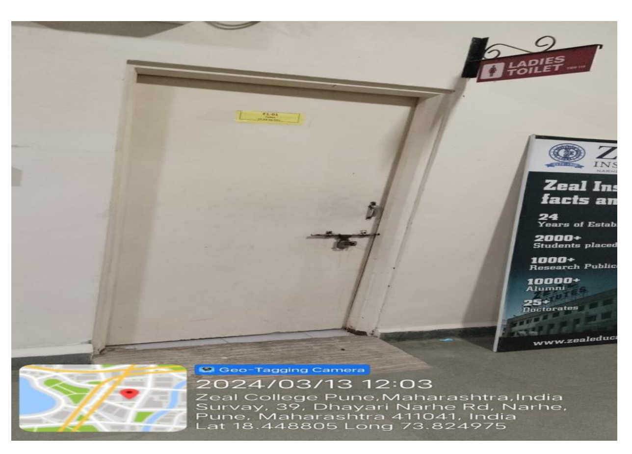
Image-7.1.7.2(b) - Divyangjan Friendly washroom at ZIBACAR (for Female)