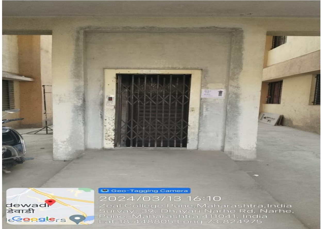
Image-7.1.7.2(e) Lift made available for ease of access at entry point ZIBACAR

ZEAL/ZB/ADMIN/SOP-19/F-09 Revision: 00 Date: 01/09/2023