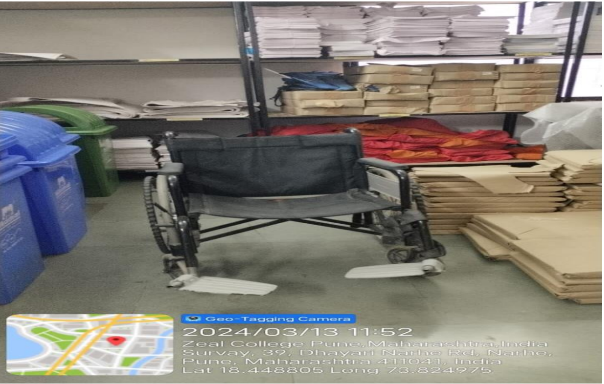
Image-7.1.7.2 (d) Recliner Wheelchair with Attendant Brake for ease of access at entry point ZIBACAR