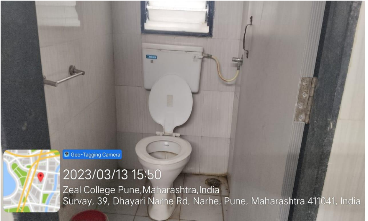
Image-7.1.7.2 (c) Recliner Wheelchair with Attendant Brake for ease of access at entry point ZIBACAR

ZEAL/ZB/ADMIN/SOP-19/F-09 Revision: 00 Date: 01/09/2023