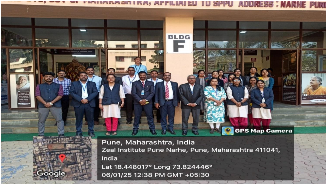
Caption: Group photo of Day-1